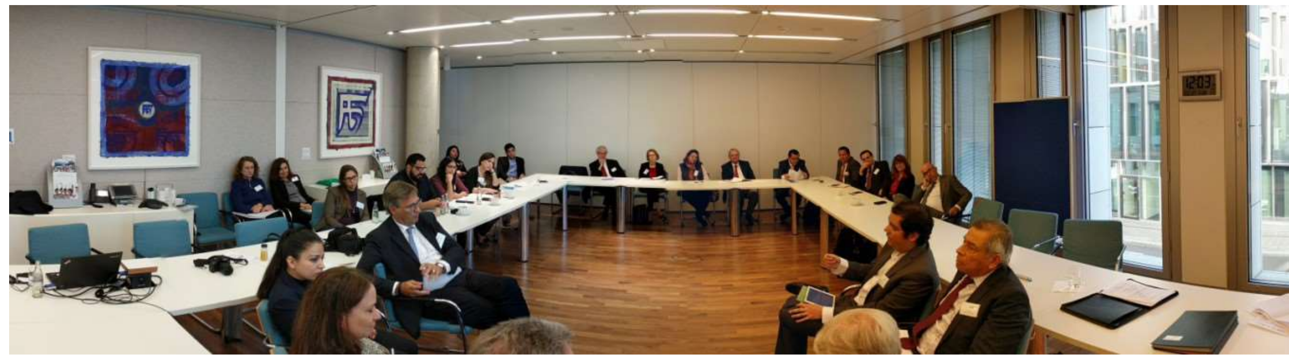
Panel de Clausura